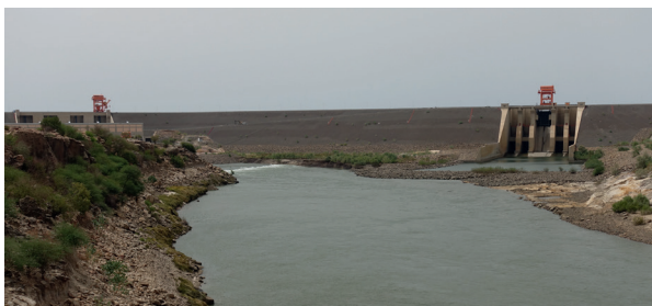
Water management in Sudan: the Upper Atbara Dam

In order to guarantee the long-term benefits of such a system, it is essential that the modules developed can be easily transferred to different computer infrastructures. Consequently, the project consortium devises cloud-ready methods in all model phases and uses interfaces that allow remote access. This enables simple data and system transfer to local and business partners at a later stage.