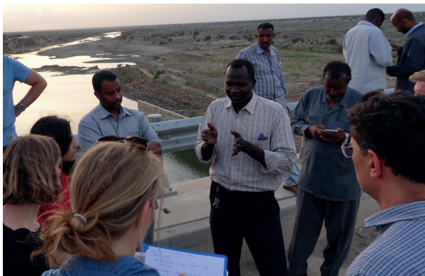
Close exchange of all project participants on site

The project closely involves local partners from Ethiopia and Sudan. Regular workshops and training courses online and in the target region as well as the exchange of PhD students ensure co-development of the SPS Blue Nile prediction system. Researchers share their methods and information and carry out joint research activities. A close involvement of participants in politics and water management in both countries allows for a transfer of results into practice and thus a sustainable implementation of the developed methods beyond project completion.