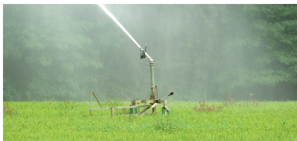
Irrigation (here in rice cultivation in Ticino, Switzerland) protects plants from drought as long as sufficient water is available.

Regulations and laws govern water abstraction and distribution. They are designed to prevent overuse and damage to natural ecosystems. A major problem, however, is the uncertainty about how the water situation will develop in the coming months. Up to now, drought management has been largely based on experience gained in dealing with