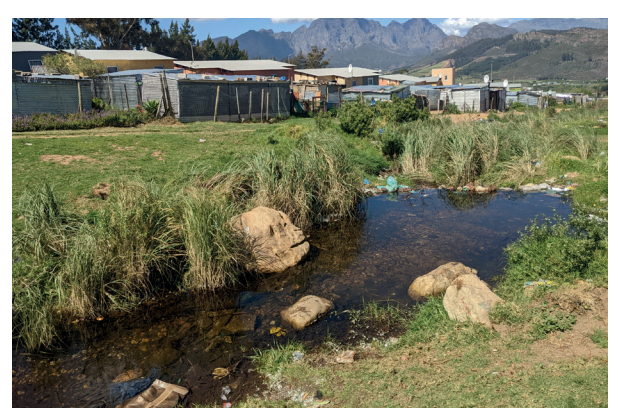
The Stiebeuel River in Franschhoek in western South Africa is heavily polluted with greywater.

The NEU-Water project participants use three different approaches to test nature-based methods for reusing rainwater and greywater. First, at a test station on the Stiebeuel River in Franschhoek, South Africa, the greywater is purified using plant and sand filters. Microorganisms in the filters break down pollutants, improving water quality. The purified water is to be used for irrigation in agriculture, for example in regional viticulture.