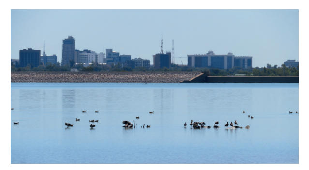
The Gaborone Dam in Botswana is part of one pilot region for the research conducted within the Co-HYDIM-SA project.

To this end, they link globally available satellite and model data for various hydrometeorological variables such as precipitation, temperature, and evaporation with climate station data from the region. These data are provided by