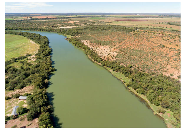
The Vaal is one of the rivers that supply the largest irrigation system in South Africa.

In the WaRisCo project, a team of researchers from Germany and South Africa is investigating these two disaster scenarios with a view to developing strategies for risk reduction and climate change adaptation. The forecasts for the drought and flood risks will be provided by a new type of hydrological model system co-developed by the project participants.