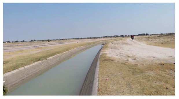
Diversion channel from the Cunene to the Cuvelai catchment in northern Namibia

The first pilot versions of the early warning and information systems will be trialed by the state water authority "Water Utilities Cooperation" (WUC) in Botswana and the "Cuvelai Watercourse Commission" (CUVECOM) in Namibia over the course of the project. The collaborative development process ensures that the systems have a holistic lens focusing on the needs of all stakeholders, thereby contributing to improved water resource management. The project is accompanied by the promotion of early-career researchers and cooperation with educational institutions in the region.