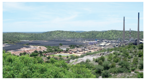
The mine in Tsumeb, Namibia, one of the pilot sites in the WaMiSAR project.

The WaMiSAR cooperation project seeks to develop climate-adapted water management strategies that will help mitigate the negative impact of mining on the environment and ensure that water resources are used sustainably.