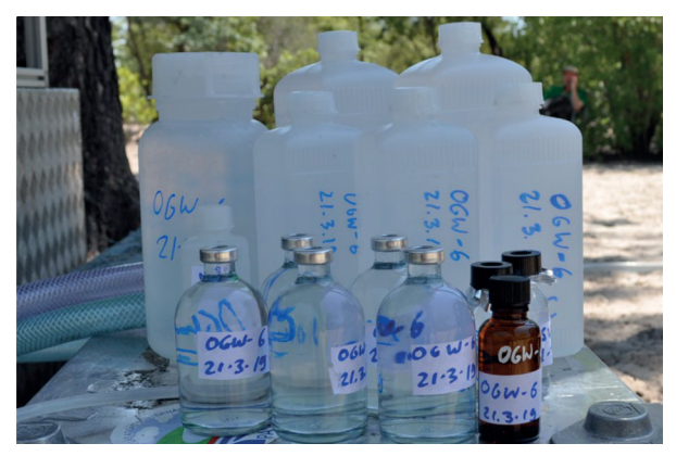
Water samples taken from the Cuvelai-Etosha Basin for geochemical analysis.

The exploration of deep aquifer systems carried out as part of the SeeKaquA project promises to deliver significant improvements when it comes to tapping into new groundwater resources. This can contribute to a more stable water supply in the long term and reduce dependence on surface water. Cooperation with local universities, institutions, and ministries ensures continuous knowledge and technology transfer, which in turn enables partner countries to independently apply the SAEM method to explore groundwater resources. This will improve water security beyond the scope of the project. In future, the technology could also be used in other regions of Africa or worldwide.