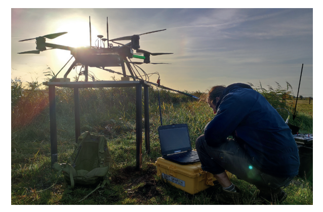
The SeeKaquA project uses a new drone-based measuring system to detect aquifers.

The magnetic field measurements require just a few power sources on the ground and can be taken from the air, covering a large area and enabling detailed analyses of aquifers down to a depth of several hundred meters. The results are used to determine suitable well locations, avoiding mistakes in well drilling. In addition, the researchers combine the geophysical measurements with data from existing boreholes, groundwater samples, and other chemical and geological analyses. This enables them to put together recommendations for a sustainable groundwater management strategy.