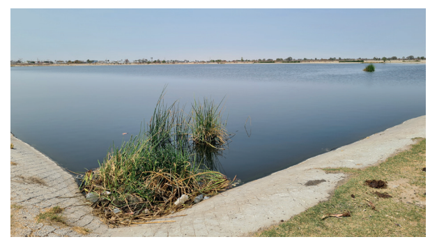
Sewage pond in Oshakati: A typical method used in many communities in Namibia. The ponds are often too small, meaning they frequently overflow during the rainy season.

First, in order to purify complex wastewater containing different contaminants for reuse in industry, the project participants are testing the use of membrane technologies such as ultrafiltration and reverse osmosis in the port city of Walvis Bay. The aim here is to achieve consistently high water quality despite fluctuations in wastewater quality.