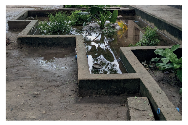
Plant filters are tested at Mburahati Secondary School in Dar es Salaam, Tanzania.

In many cities in Southern Africa, heavy rainfall is increasingly causing rain and wastewater to mix, resulting in the need for treatment. In the NEU-Water project, nature-based processes for cleaning and reusing rainwater and wastewater are developed that specifically address problem areas in the urban water cycle and can be easily integrated into urban planning. The researchers, management teams, and water utilities will work together to develop a manual outlining the technical details of the processes, legal requirements, and financing options for local implementation. In the long term, it is planned that the solutions developed in the project should also be transferable to other low-income urban areas with minimal financial investment.